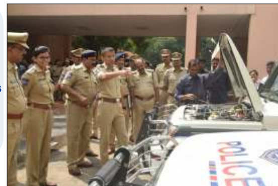
Police officers of Ramagundam Commissionerate participating in crime review meeting held in NTPC