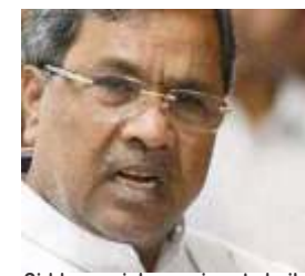
Siddaramaiah promises to build police memorial, hike pay