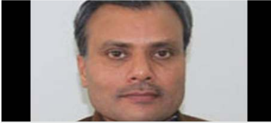
In a directive issued by the Delhi Police Commissioner Amulya Patnaik states that all the station house officers (SHOs) across the city have to fill performance appraisal forms every two months.

In a directive issued by the Delhi Police Commissioner Amulya Patnaik states that all the station house officers (SHOs) across the city have to fill performance appraisal forms every two months. This decision comes in order to keep a tab on the performances of the police officials and also to change the image of Delhi Police. As per the report by the Indian Express, a corporate-style 'bi-monthly performance appraisal form' comprises of several sections that includes a table to record cases of robbery, snatching, murder, vehicle theft, etc, in the previous year and the current one. A section also includes a col-