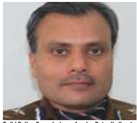
Delhi Police Commissioner Amulya Patnaik directs SHOs to fill bi-monthly performance appraisal form

A monthly bulletin highlighting the achievement of various State Police & CAPFs