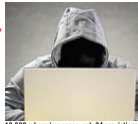
10,000 cybercrime cases, only 34 convictions in Maharashtra between 2012 and 2017